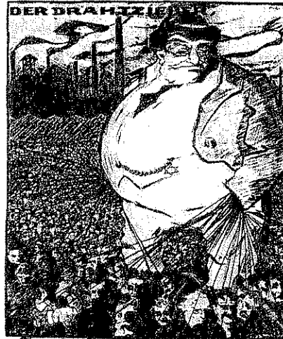
Kopf u Handarbeiter wählt: